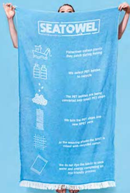
LARGE 170 x 100 cm