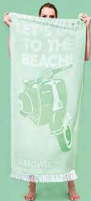
MEDIUM 70 x 140 cm