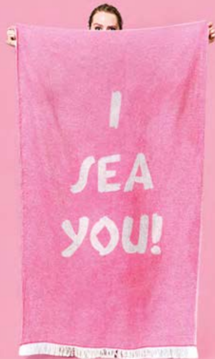
XL 200 x 100 cm